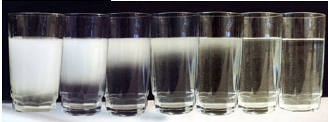
Massachusetts Water Resources Authority

Cloudy water, also known as white water, is caused by air bubbles in the water, and is completely harmless. Cold water holds more air than warm water. In the winter, water travels from above ground storage tanks which are very cold and warms up during its travel to your tap. Some of the air that is present is no longer soluble, and comes out of solution.