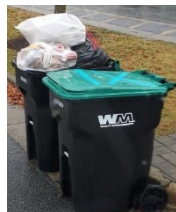
Overflowing cart might not be picked up.