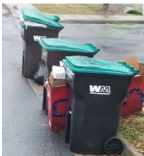
Please, no trash beside cart.

Trash left at the curb MUST be inside the trash cart with the lid opening facing the street. Bags left beside the cart will not be picked up, and trash overflowing the cart could cause all of your trash not to be collected. The trash company uses an automated arm so if the lid is not down on the cart, emptying the container is difficult and could prevent trash from being collected. You must also ensure there is 3 feet of clearance around your cart. If you routinely have more trash than your cart will hold, please contact the Town Office (540-465-9197) and request an additional cart; the cost is $1.02 per month. You can also take excess trash to any Shenandoah County Convenience Site; the closest to Strasburg is located at 321 Powhatan Road.