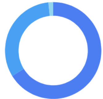
Sessions by device